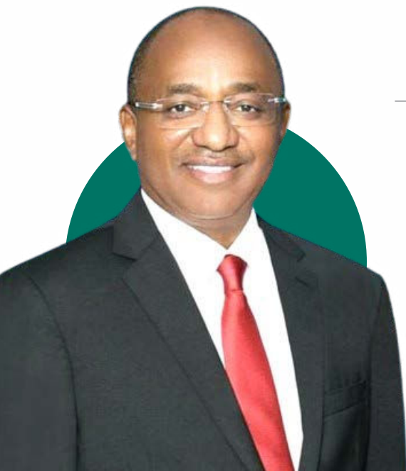
H.E. DR. HUSSEIN ALI MWINYI, PRESIDENT OF ZANZIBAR